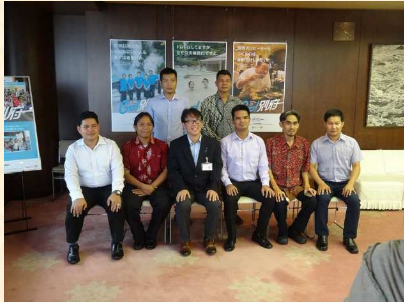
Courtesy call on Mayor of Beppu City