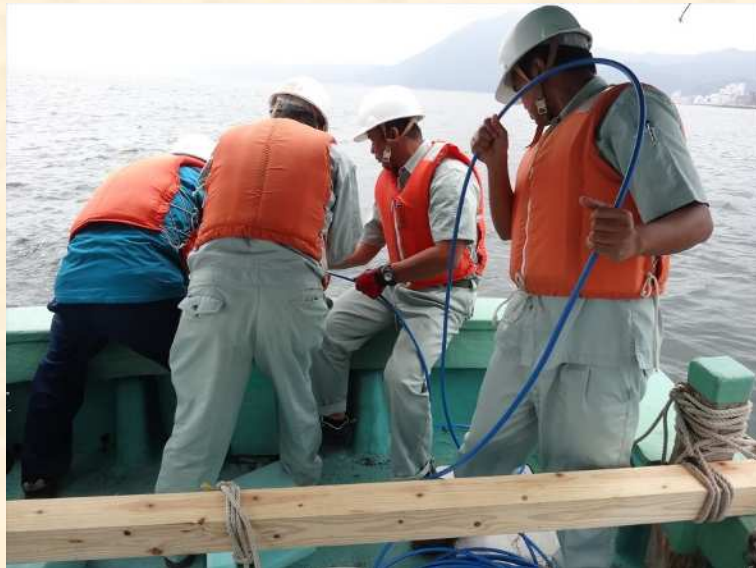
Side Scan Sonar Survey