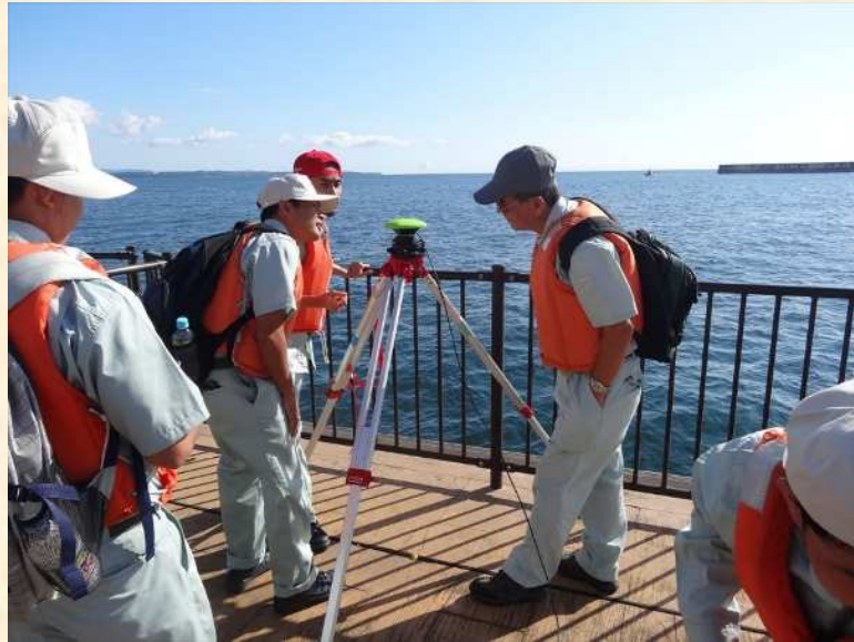
Control Point (GNSS) Survey