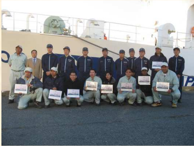
Group Photo in front of S/V “Meiyo”