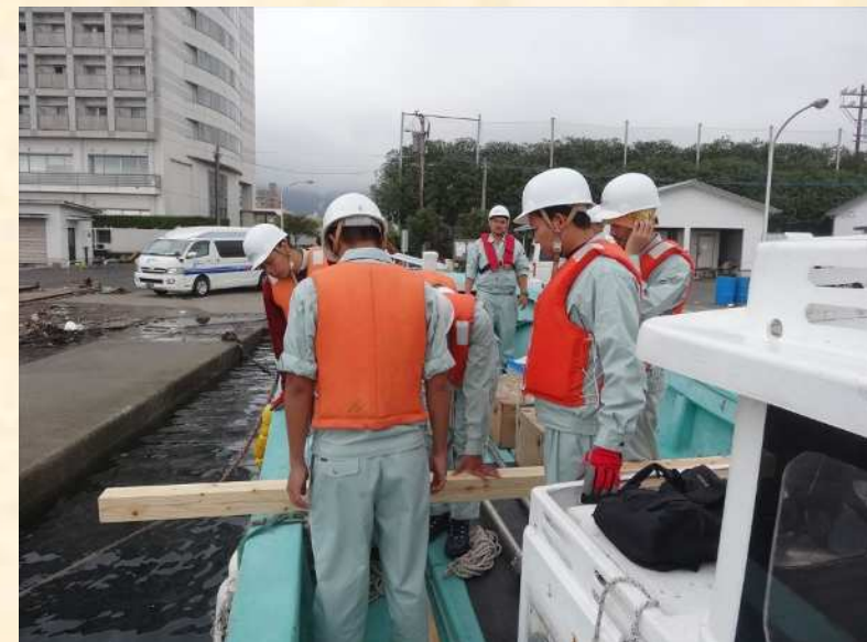
Fixing Single-beam Sounding Equipment onto Chartered Boat