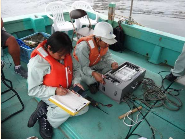
Single-beam Sounding by Chartered Boat