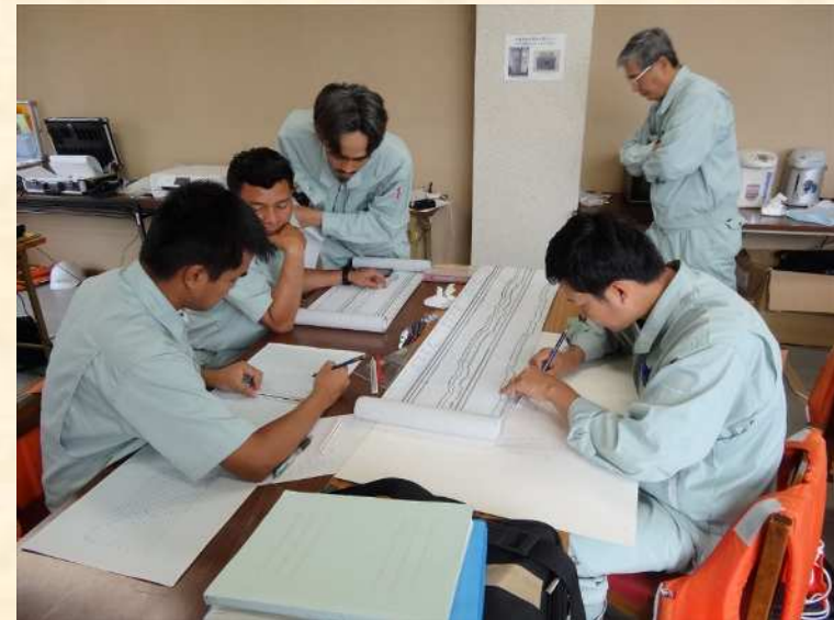
Data Processing at Survey Site