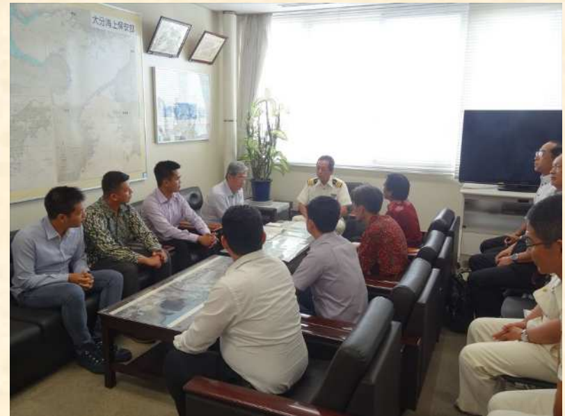
Courtesy call on Director of Oita CG Office