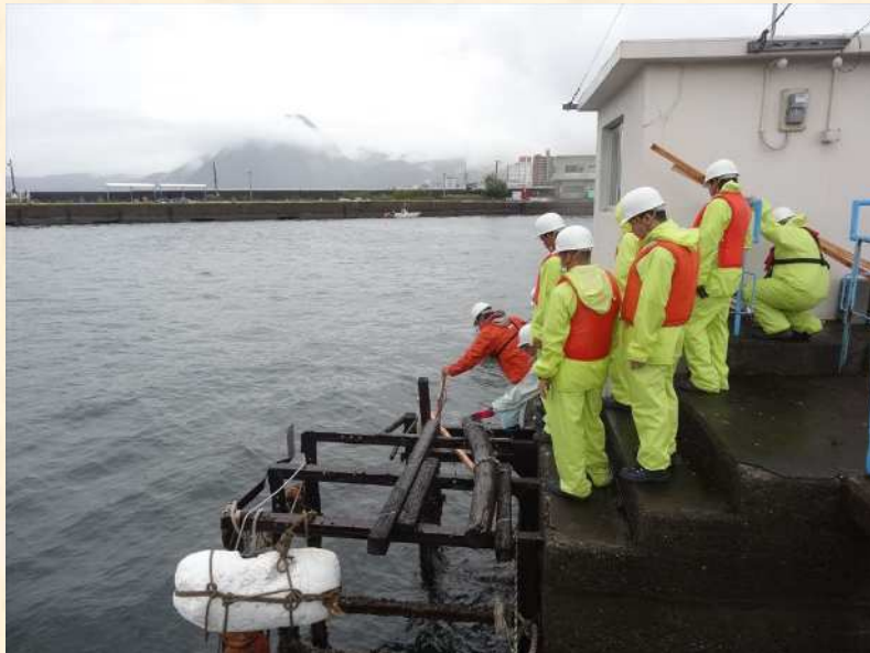
Establishment of Temporary Tide Station