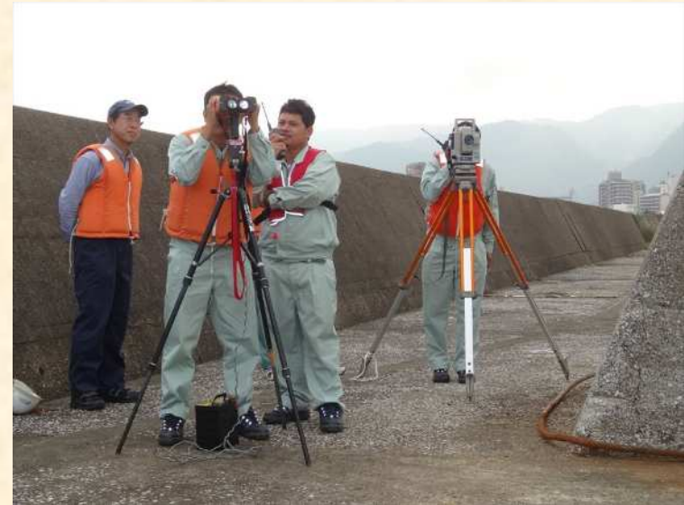
Guiding Chartered Boat